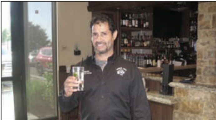
The best guy at the meeting, our bartender and serving manager!